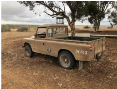
LAND ROVER S2A PICK UP, 1969