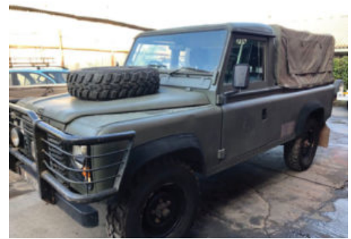
LAND ROVER DEFENDER V8, 1998