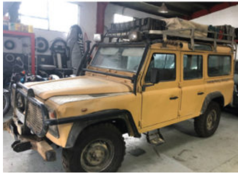
LAND ROVER DEFENDER, 2002, LHD